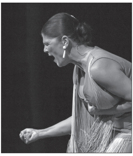
Anabel Rivera Spain / Singing